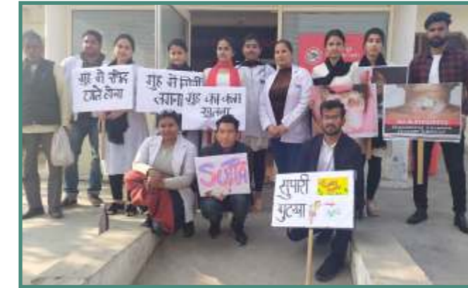
Cancer awareness programme at Ghangola