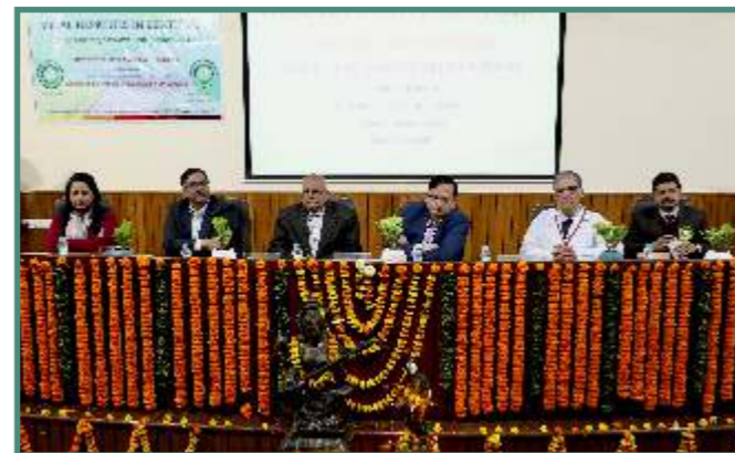
Seminar on Viral Hepatitis in Dentistry