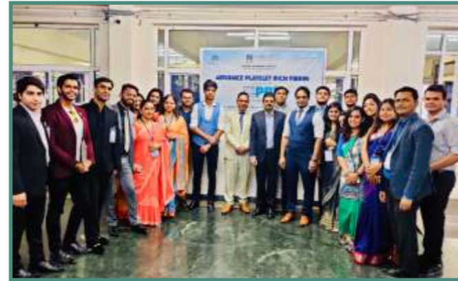
Advance Platelet Rich Fibrin