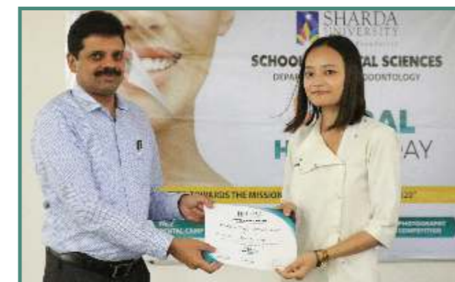
Oral Hygiene Day