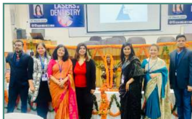
One day workshop on lasers in dentistry