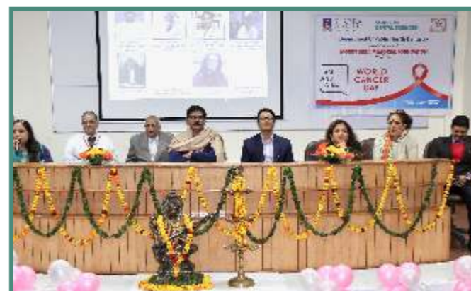
World Cancer Day