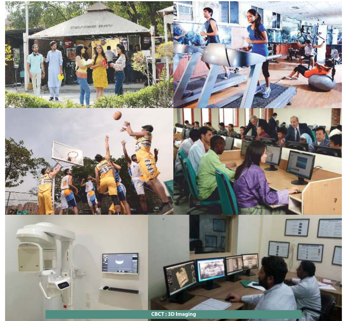
CBCT : 3D Imaging