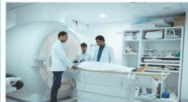
3 TESLA MRI