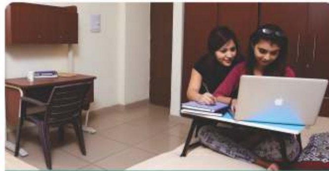
IN CAMPUS RESIDENCES