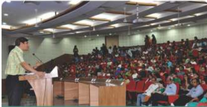
AUDITORIUMS & SEMINAR ROOMS