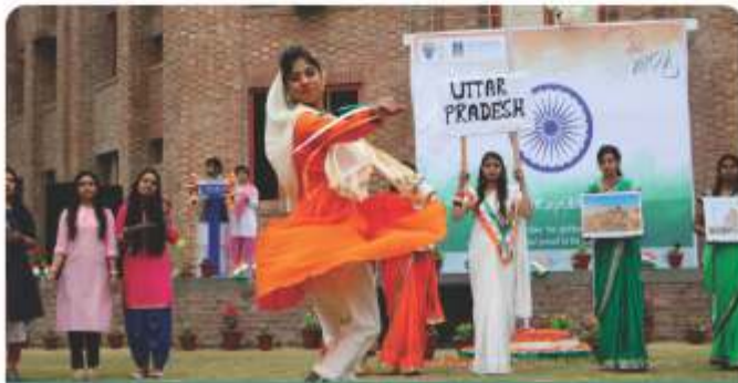
STUDENTS ACTIVITY CENTRE