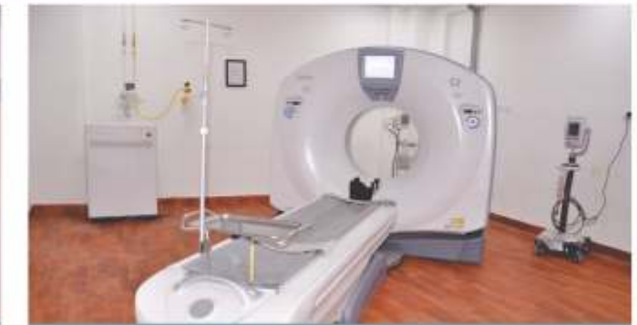
128 SLICE CT SCAN