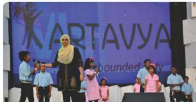
KARTAVYA SOCIAL ACTIVITY (NGO)